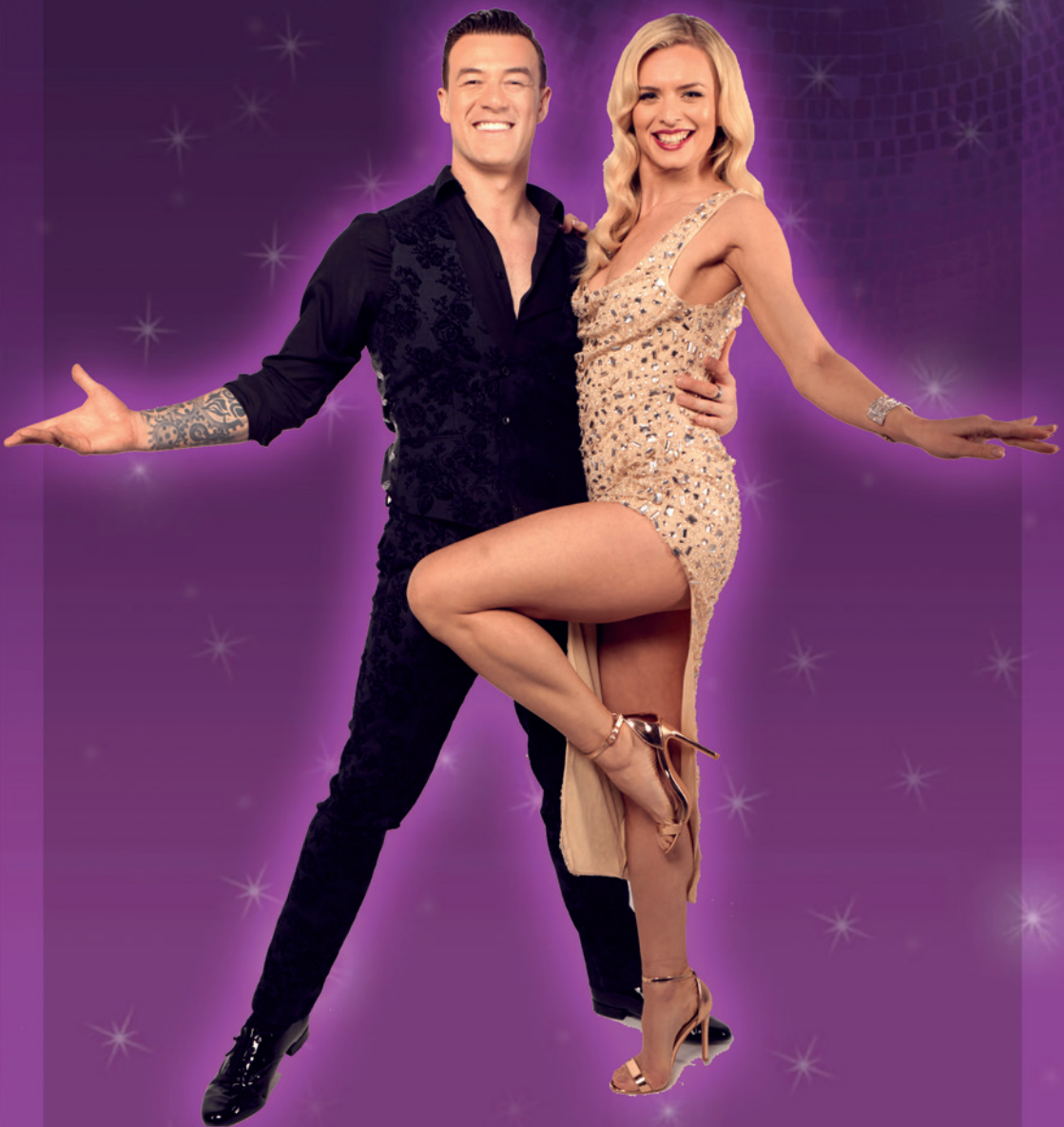
Kai Widdrington & Nadiya Bychkova